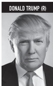
DONALD TRUMP (R)